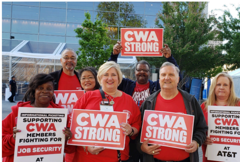
The Executive Board of CWA Local 6001 joined in a Solidarity March with AT&T employees in Dallas to protest offshoring of U.S. jobs.

All the Local 6001 officers are looking forward to the October 2018 Delegate Assembly in Dallas, and they've already begun planning activities leading up to that meeting to make sure members are fired up and mobilized.